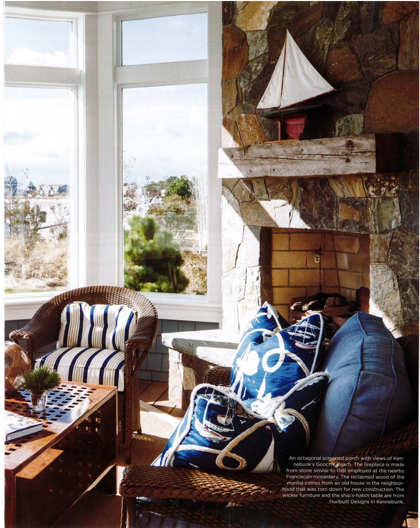
An octagonal screened porch with views of Kennebunk's Gooch's Beach. The fireplace is made from stone similar to that employed at the nearby Franciscan monastery. The reclaimed wood of the mantel comes from an old house in the neighborhood that was torn down for new construction. The wicker furniture and the ship's-hatch table are from Hurlbutt Designs in Kennebunk.